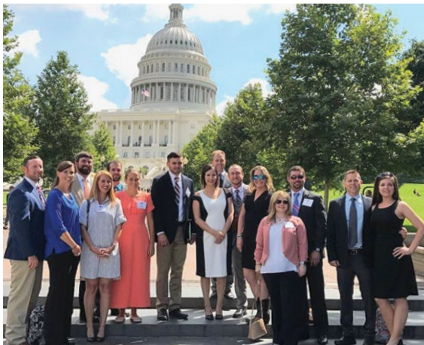
The Farm Credit Young Leaders group visited the U.S. Capitol in July.

a neighbor's dairy farm. In 2012 they purchased a home on a 75-acre poultry farm in Albertville, Ala., where they raise chickens and cattle. The Alabama Farm Credit members enjoy sharing the farm life with their two young children.