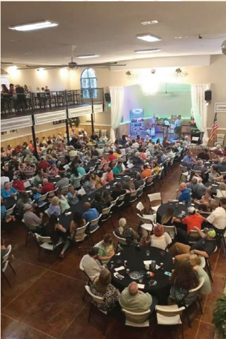
Customers enjoy the well-attended dinner in Albertville.