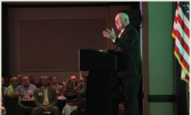
Above: U.S. Agriculture Secretary Sonny Perdue delivered the keynote address to 630 Farm Credit representatives from across the country.