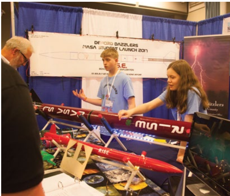
The rocket fair in Huntsville gave students the opportunity to show off their handiwork.