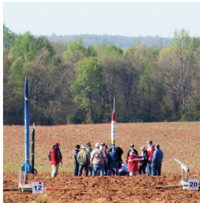
Preparing to launch at Bragg Farms