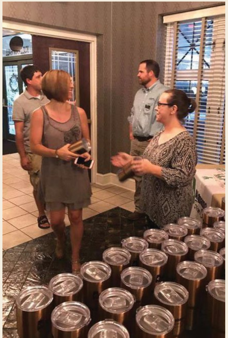
Cullman staff greet members as they arrive at the appreciation dinner.