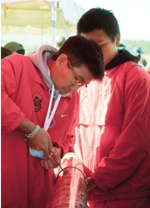
Students fine-tune their rocket at the April 5 launch.