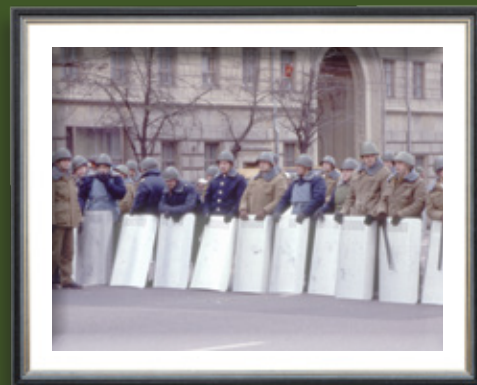
Scene from Russia trip