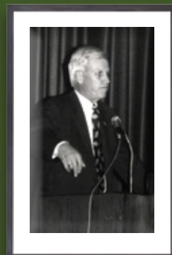
Former U.S. Rep. Charlie Stenholm