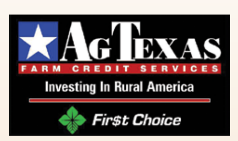
This AgTexas sign was posted during construction of Memorial Hospital.

association income, but by giving our members the ability to repay their loan obligations should disaster strike.