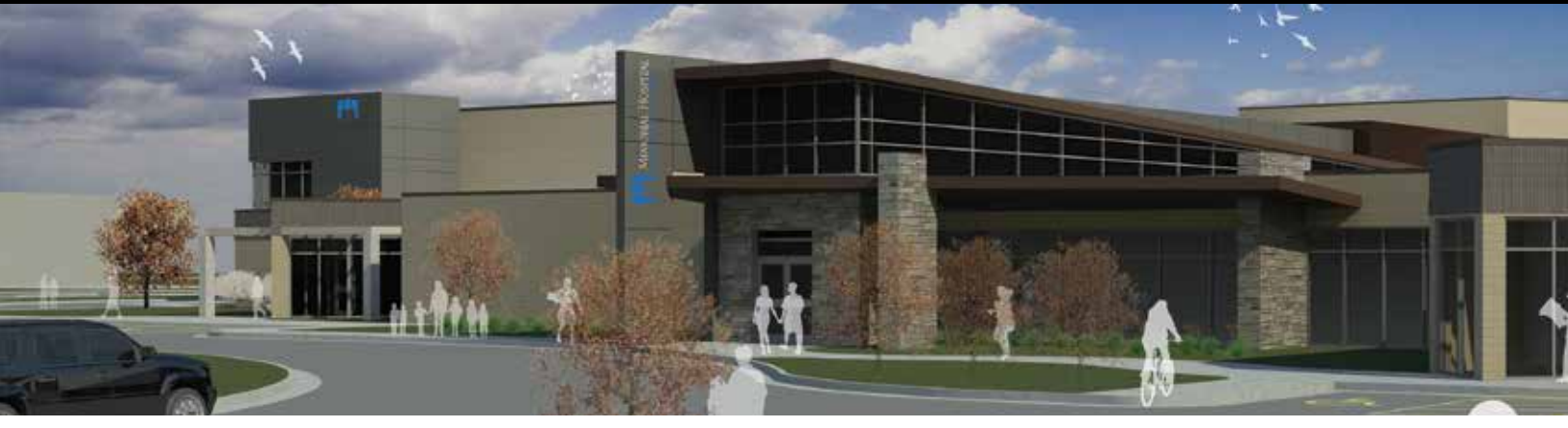
One way AgTexas serves rural America is by investing in community infrastructure and facilities, such as Memorial Hospital in Seminole. Above, artist's rendering of the hospital and grounds.

Previously, the cooperative did not have the dedicated resources to maximize this growth opportunity beyond investments in the guaranteed portion of rural America bonds (of the former rural America bond program) and similar instruments. Recognizing the potential in this area, however, the AgTexas board and senior management last year established a new department specializing in loan participations.