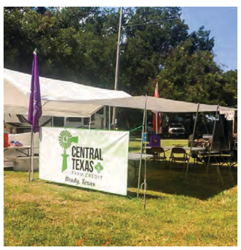
The Central Texas tent at the cook-off