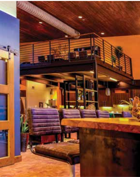
The Hub room offers a kitchen, a dining area and a cozy place to take a break.

Then, for the staff, there was packing, moving, unpacking and learning their way around a new office building, all the while serving customers and keeping the back office running.